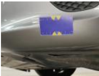
Bonnet, Chemical polution, Polish