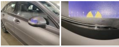
Outside rear-view mirror housing R, Scratch(es), Polish