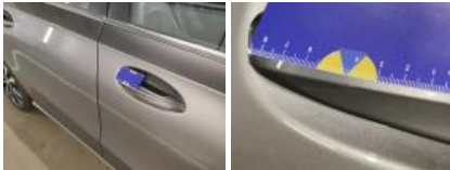
Bodywork, No damage, Check