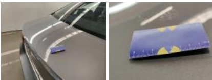
Bumper trim R, Scratch(es), Acceptable