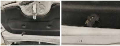
Bonnet, Stone chip(s), Repair and paint (complete)