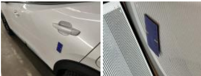
Bodywork, No damage, Acceptable