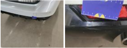
Rear light L, Scratch(es), Polish