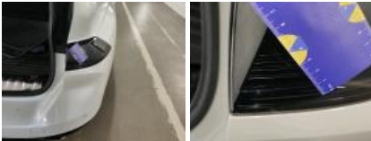
Bumper moulding R, Scratch(es), Acceptable