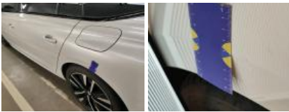
Bumper R, Scratch(es), Acceptable