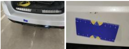
Rear light R, Scratch(es), Polish