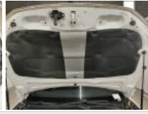
Roof, Hail damage, Paintless dent repair (hail)