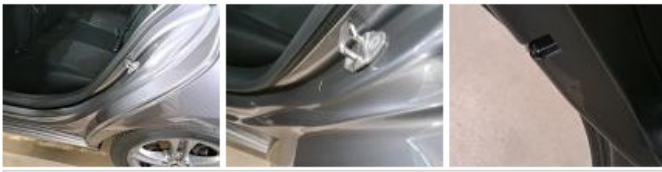
Door seal FL, Broken, Replace